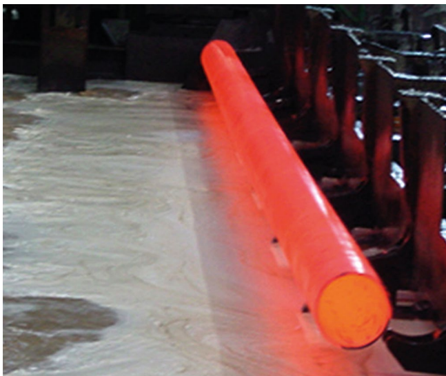
Hot metal is quenched

PETROFER's water dilutable quenchants are successfully used in many applications. The water dilutable quenchant FERQUENCH 2000, as an example of technical progress, has been used as a replacement for quench oil in many tank quenching applications. This has provided users of this product an improved, safer, cleaner work environment, due to chemistry which is absolutely non-combustible, thus reducing flames and fumes.