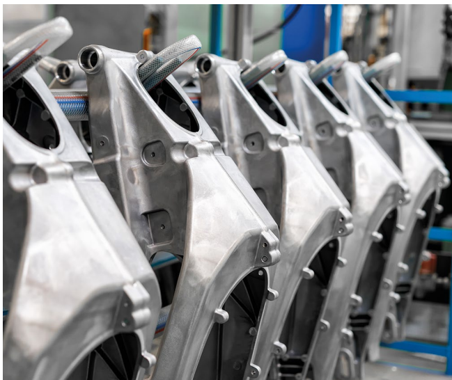
Aluminium car parts, casting process in the automotive industry factory

A special die-lube technology is the unique DIE-LUBRIC BS series. Due to the outstanding flushing abilities and the special raw material selection the risk of clogging in pipelines, filters and spray nozzles from bacteria and fungi is safely avoided.