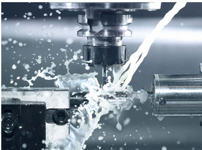
Close up of CNC machine at work using one of our metal cutting fluids

The water dilutable cutting fluid EMULCUT 160, is frequently used in aerospace manufacturing processes. It is especially used for materials that are difficult to machine for example aircraft aluminium, titanium and nickel based alloys. This high performance product ensures an excellent buffer system and thus provides an exceptionally long service life, while being stain free on sensitive 6000 and 7000 series alloys. One of our neat oils in the ISOCUT series offers a high lubricating performance especially with difficult materials, and significantly reduces tool wear. The product is successfully used by bearing manufacturers. The grinding and honing oil has a high flash point and low evaporation rate.