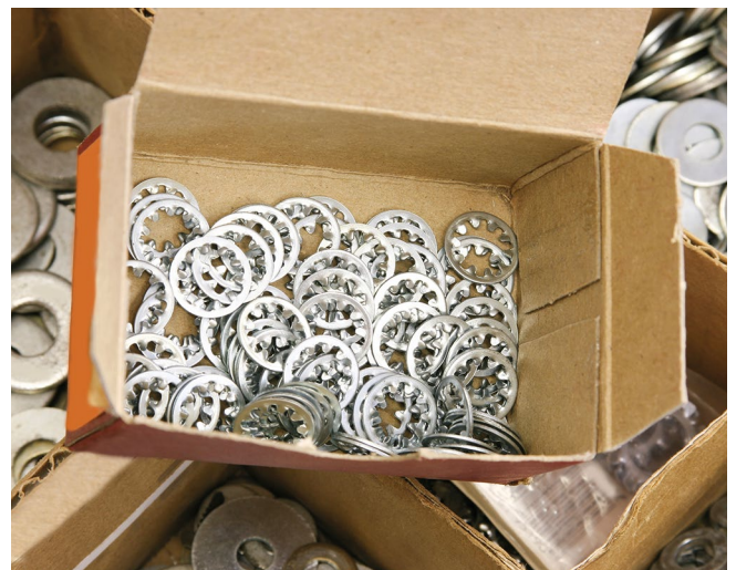
Parts protected with water soluble rust preventive ready for packaging